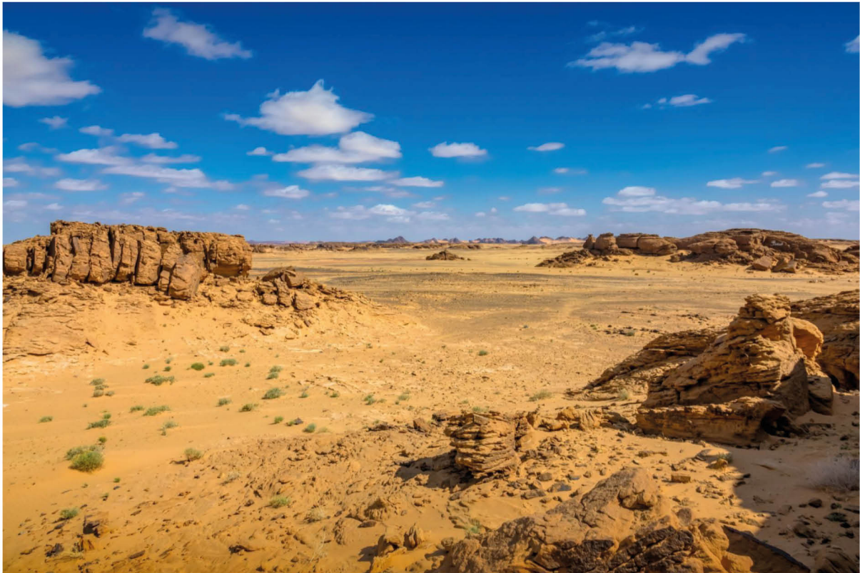
The desert landscape in Al Jawf province benedek

The update on Dream of the Desert is one of many as Saudi Arabia fast-tracks its ambitions to become a leading tourist destination, with plans to attract 150m visitors by the end of the decade. Last year was marked by news of hotel and resort developments across the Kingdom, from AlUla , the ancient oasis city near the sandstone monuments of Hegra; to the Red Sea coast and its islands; Sindalah Island, part of the Neom gigaproject; and the historic settlement of Diriyah.