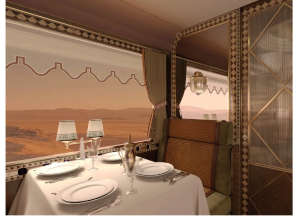
The restaurant car will allow panoramic views over the desert.

Reception lounges have been given the feel of a majlis — the room in a Saudi home where guests are welcomed — and include geometric patterns and hand-carved wooden elements. Bedrooms, meanwhile, have a richer feel, with a hint of Art Deco styling in the emerald-colored sofas, headboards and drapes, as well as the clean lines and wood-paneled walls.