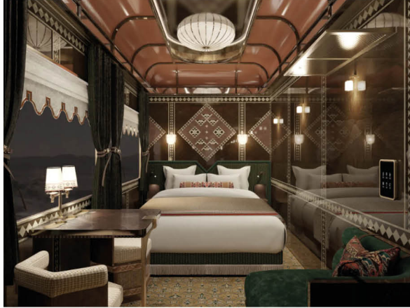
Bedrooms have a glam, almost Art Deco feel.

The overall tone is suitably sandy, with golds, beiges and darker tones coupled with chrome fittings reflecting the desert views outside.