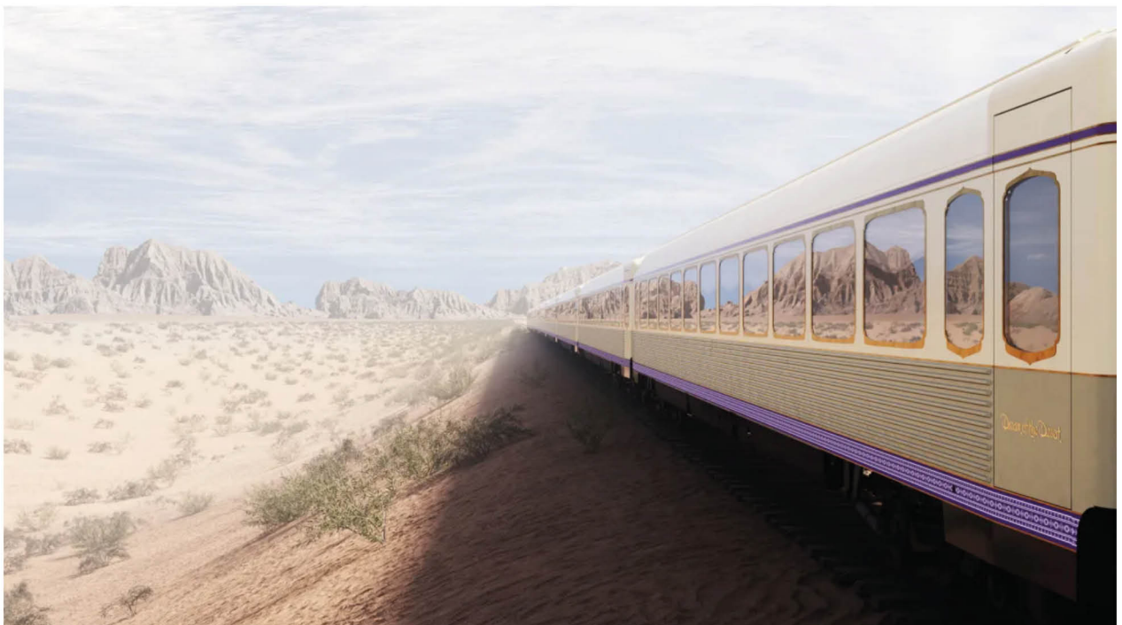
The train has been designed by architect Aline Asmar d'Amman.

The train will have 34 suites across 14 carriages, while the restaurant menu will be curated by “local and international chefs,” according to the press release accompanying the renderings.