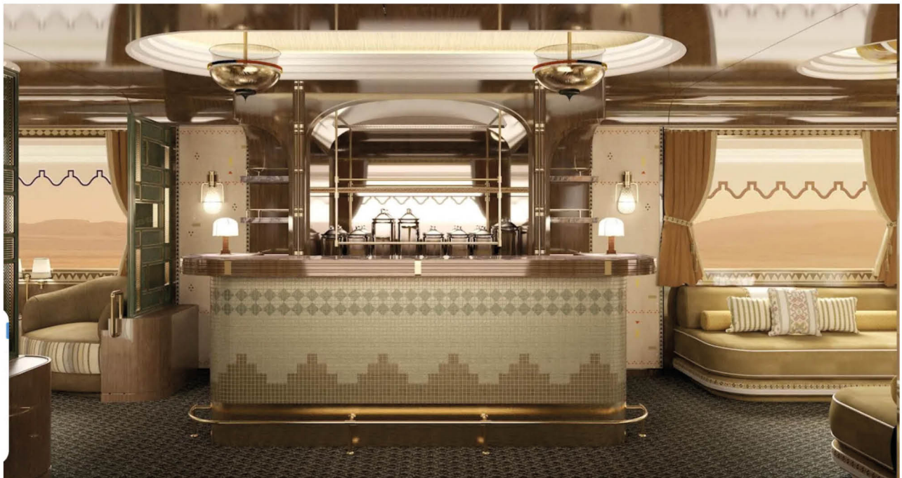
Reception areas merge traditional Saudi design with opulent touches

Manufactured by the Italian hospitality company Arsenale Group and commissioned by Saudi Arabia Railways (SAR), Dream of the Desert's 14 carriages will consist of 34 luxury suites. A first look at the interiors, designed by Lebanese architect Aline Asmar d'Amman, shows opulent gold-laden ceilings, tile-fronted bars, rich velvet banquettes and touches of Saudi tradition. Reception areas have been inspired by majlis settings, adorned with intricately carved wood and shades inspired by the desert sands. Special art pieces showcasing Saudi heritage and culture are being commissioned to hang in the train's corridors, with menus will be created by local and international chefs.